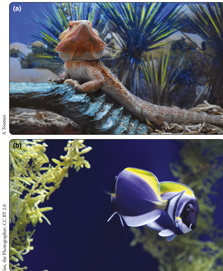
Figure 1. Exotic pets are those that are kept for non-utilitarian reasons and have a relatively short history of domestication; examples are as diverse as the (a) central bearded dragon ( Pogona vitticeps ) and (b) powder blue surgeonfish ( Acanthurus leucosternon ). Dragons are sourced from captive breeding facilities and surgeonfish from the wild, and although neither species is considered threatened with extinction, it is illegal to export dragons from their native Australian range.

Keeping vertebrate animals as household companions is extraordinarily widespread and growing in popularity globally (Ramsay et al. 2007; Carrete and Tella 2008; Bush et al. 2014). In the US, Australia, and the UK, over half of all households have at least one pet (Reaser and Meyers 2007). Although pet ownership per household is lower in China than in Western countries, China now ranks third among countries with the most pets, with a companion animal population of more than 100 million (Deng 2017). In the US, approximately 50% of pets can be considered “exotic” (APPA 2018): that is, pets without a long history of domestication, unlike dogs, cats, or horses (Figure 1; Bush et al. 2014). Exotic pet ownership has grown markedly in recent decades (Rhyne et al. 2012; Vall-Ilosera and Cassey 2017a). For instance, ownership of reptiles and amphibians in the US has more than doubled in less than two decades, from 2.4 million households in 1994 to 5.6 million in 2012 (APPA 2018). Keeping exotic pets is also geographically widespread. In Indonesia, Jepson and Ladle (2005) found that households were more likely to keep exotic pets, such as birds (22%) and fishes (9.5%), than they were to keep common domesticated pets, such as cats and dogs (3% or less). In some